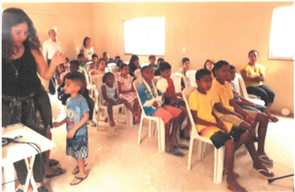
Children gathering for Sunday school.