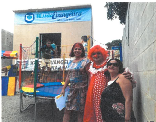
Front view of church and entrance. Man in clown suit helped with Sunday school.