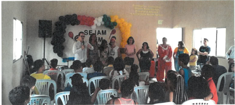
Left: Picture of the land before church was built. Above: Picture of congregation in Primavera Church on the day of dedication, April 19, 2020.